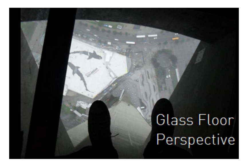
Click <u>HERE</u> for <u>elevator facts</u>.

Your Gateway to the Floor Covering Industry