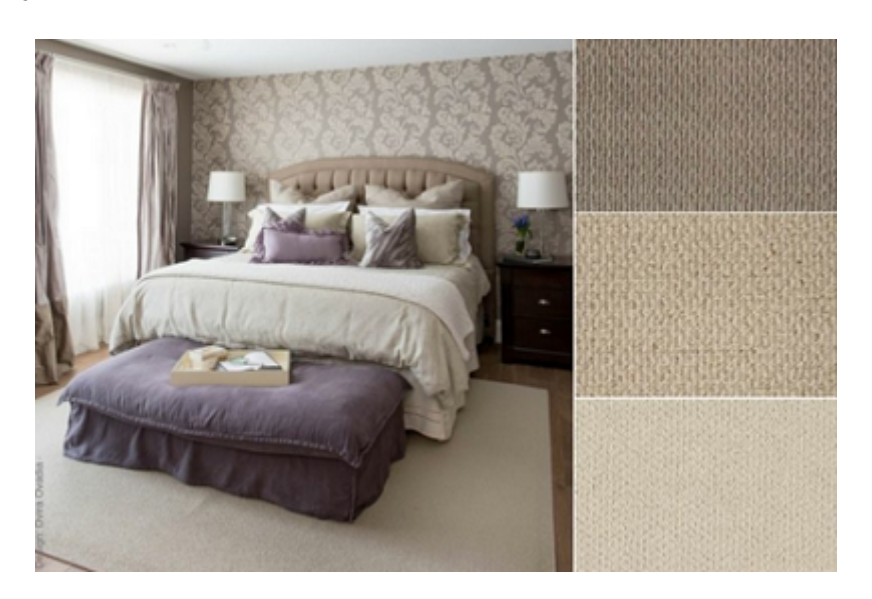
Using Carpet for Rug Designs

Vinyl plank flooring offers the rustic look of hardwood without the worry. It is a photographic image of hardwood flooring. With technological developments, it is not as easy to differentiate between hardwood flooring and vinyl plank flooring. Often homeowners are challenged to distinguish between the two by sight or touch until they are informed which is which.