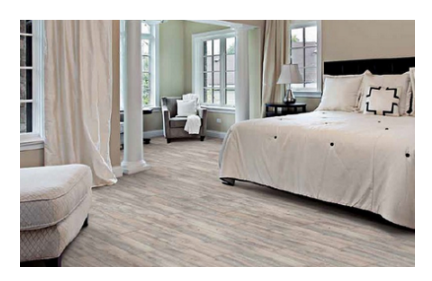
Using Luxury Vinyl Flooring Instead of Hardwood

Your Gateway to the Floor Covering Industry