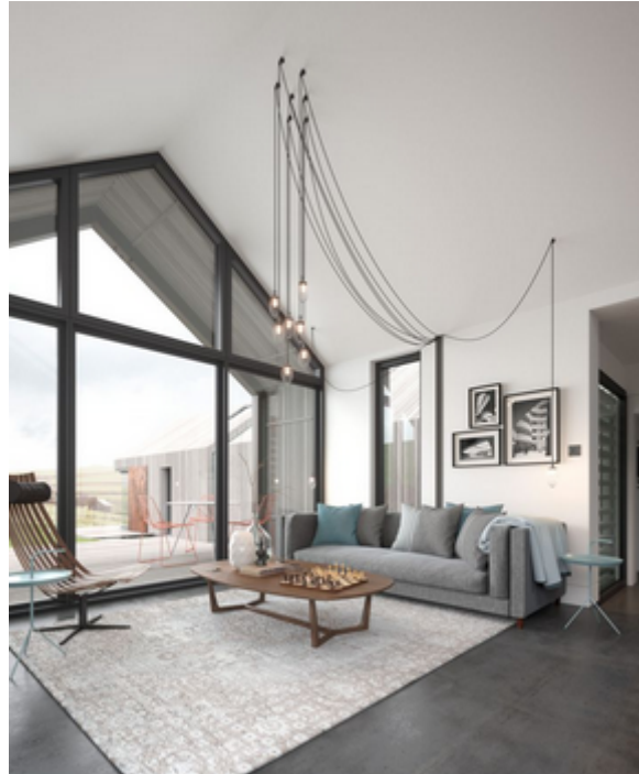
Radiant look and feel

Your Gateway to the Floor Covering Industry