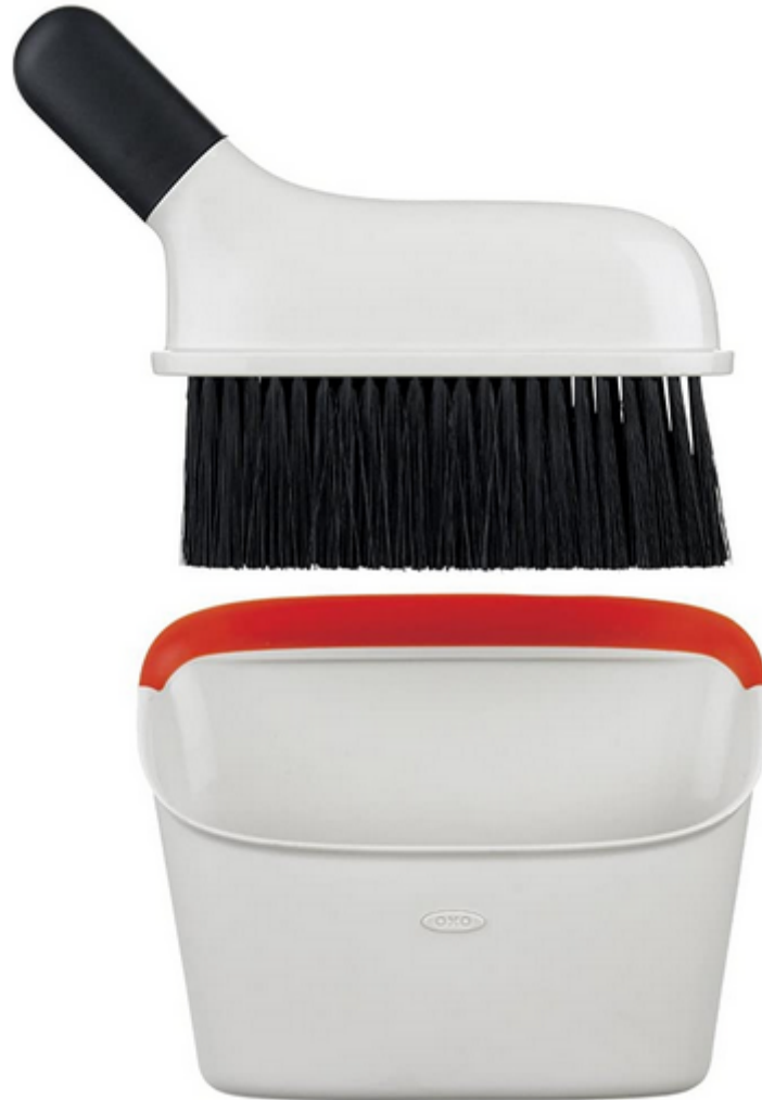
OXO Good Grips Compact Dustpan and Brush Set

Your Gateway to the Floor Covering Industry