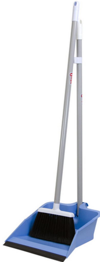
Quickie 429 Flip-Lock Dust Pan & Lobby Long Handle, Upright Broom and Dustpan Set, 1-Pack, Grey & Blue

Your Gateway to the Floor Covering Industry