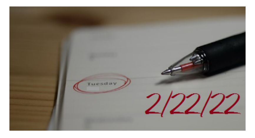
Relax. It's not a 'date' date. It's 'the' date 2/22/22. It falls on a Tues (2's) day.