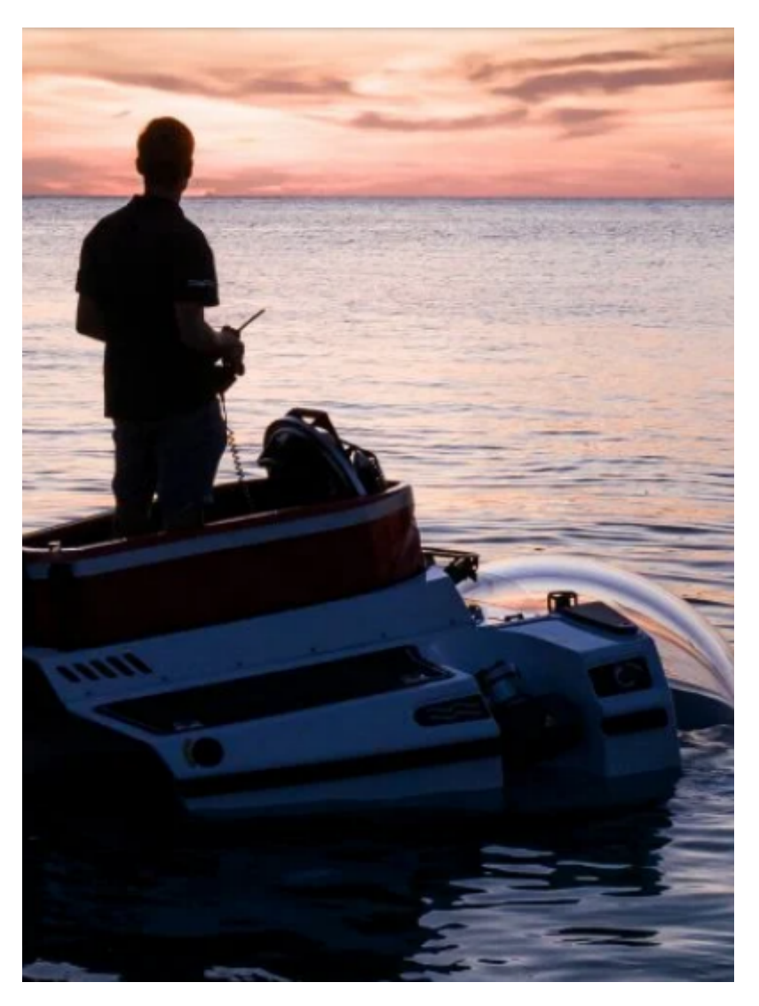
Sub Center Curaçao is the very first submersible training center in the world.

Your Gateway to the Floor Covering Industry