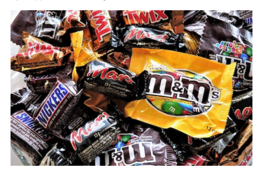
Spontaneious shoppers find impulse items in narrow checkout lanes tempting.