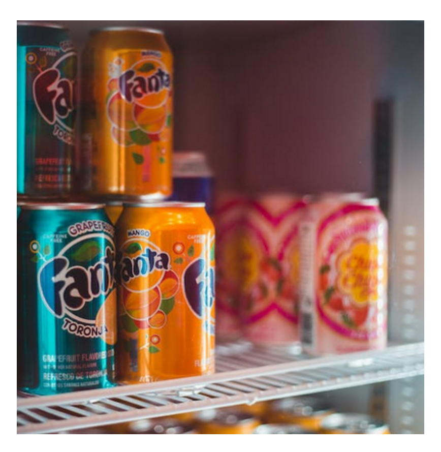
Thirsty shoppers reach for single-serve soft drinks in convenient cold cases.

Your Gateway to the Floor Covering Industry