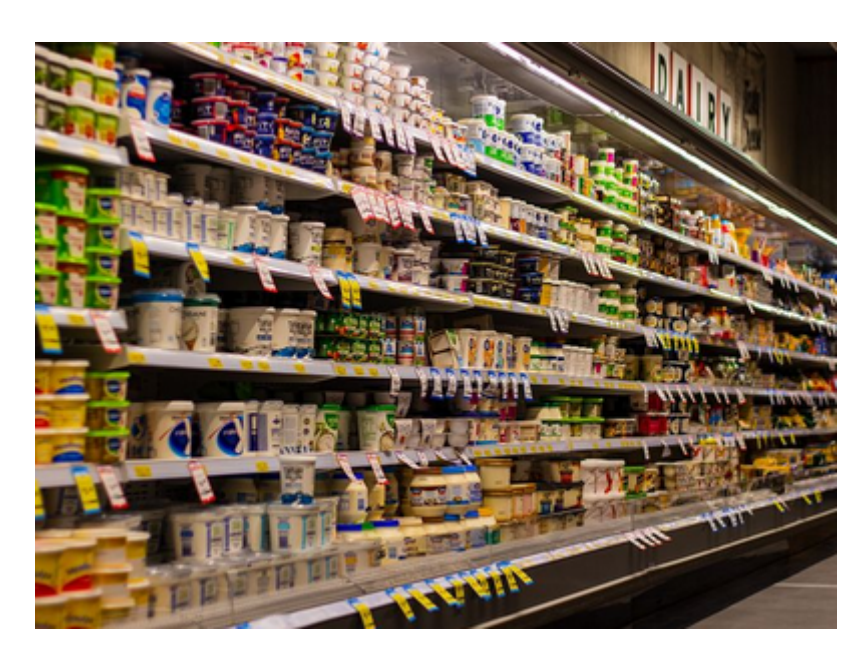
Clever? You bet! Staging strategies guide you to the corners of the building.

wheels, as they traverse over the tiles. It seems as though you're moving too fast. You slow down the cart and spend more time; sauntering through the store, at a pedestrian pace, shoppers usually tend to meander and find things they need or want. The goal is to slow you down to a pace where you notice items you didn't realize you needed.