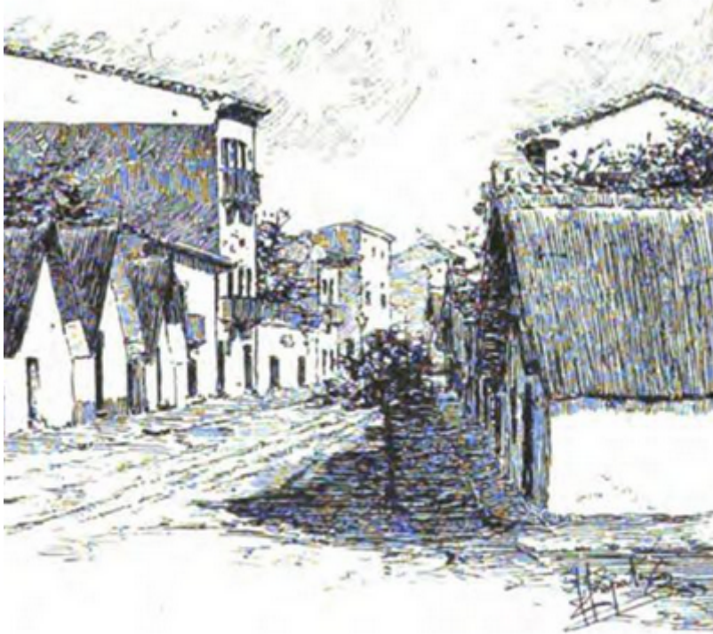
VALENCIA. — CALLE DEL CABAÑAL.

The primary reason that El Cabañal (Also spelled: El Cabanyal ) remains one of Valencia's historic neighborhood is because the town still conserves its traditional architecture with a colourful use of ceramic tiles on the façades and interiors of its buildings. On this theme, WOW Design's ceramic tiles are what recapture the tile's vintage aesthetics during the period with an original tile mosaic that represents the foam of a sea wave. Interior design studio Saramar Home was the organization chosen to refurbish the entire building; although it was ultimately decided to conserve the original tiled façade for the project; a family home in El Cabañal; Valencia's former fishermen's quarter.